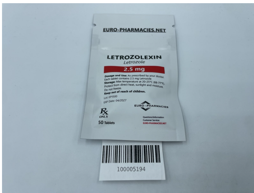
Photo of the test sample

The test sample was applied in the amount of 3 \mu l to the BioBasic 8 Thermo Scientific column. During the analysis with the method a linear gradient in the solutions of H 2 O and Acetonitrile with the addition of 0.1% trifluoroacetic acid, a peak of the sought substance appeared. Its concentration, when compared to the reference chromatogram, is 2,88mg/tab. The measurement error is + - 0,05mg. The actual state of the sample sent before the test is presented on the photo below