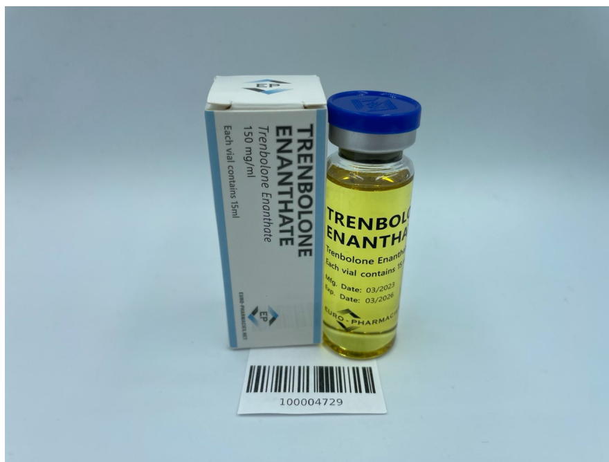
Photo of the test sample

The test sample was applied in the amount of 3 \mu l to the BioBasic 8 Thermo Scientific column. During the analysis with the method a linear gradient in the solutions of H 2 O and Acetonitrile with the addition of 0.1% trifluoroacetic acid, a peak of the sought substance appeared. Its concentration, when compared to the reference chromatogram, is 148,92mg/ml. The measurement error is + - 1mg. The actual state of the sample sent before the test is presented on the photo below