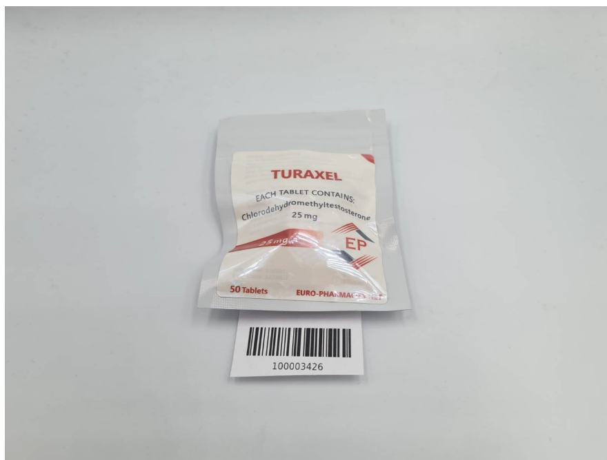
Photo of the test sample

The test sample was applied in the amount of 3 \mu l to the BioBasic 8 Thermo Scientific column. During the analysis with the method a linear gradient in the solutions of H 2 O and Acetonitrile with the addition of 0.1% trifluoroacetic acid, a peak of the sought substance appeared. Its concentration, when compared to the reference chromatogram, is 24,39mg/tab. The measurement error is + - 0,05mg. The actual state of the sample sent before the test is presented on the photo below